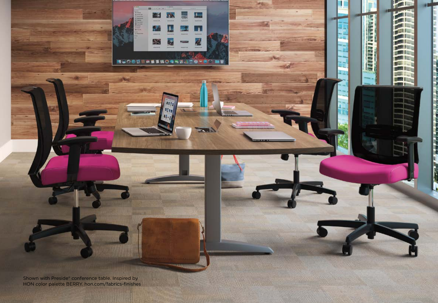
Shown with Preside® conference table. Inspired by HON color palette BERRY. hon.com/fabrics-finishes