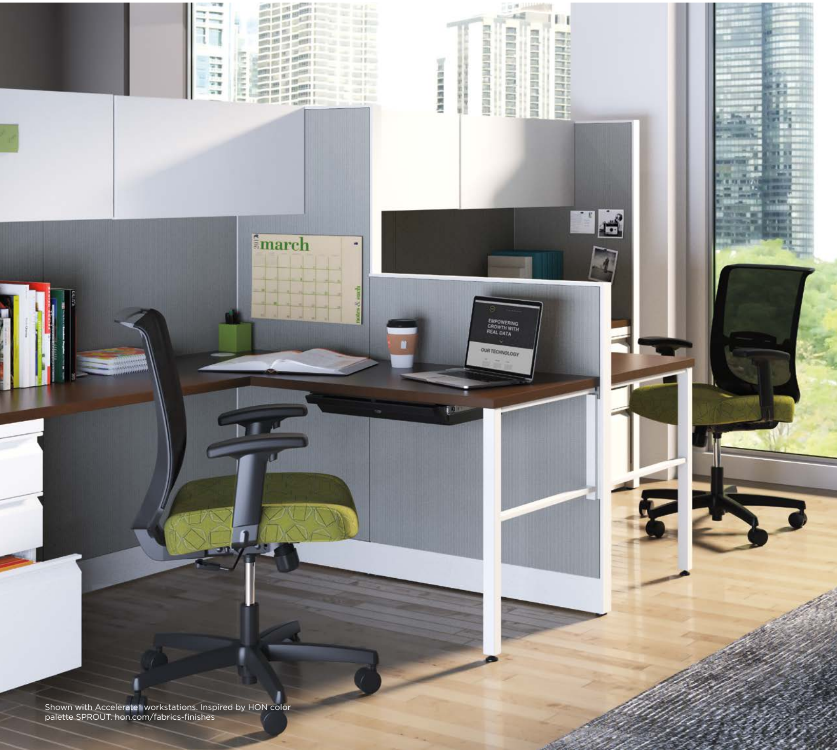
Shown with Accelerate® workstations. Inspired by HON color palette SPROUT. hon.com/fabrics-finishes

DESIGNED, ENGINEERED & ASSEMBLED IN THE USA