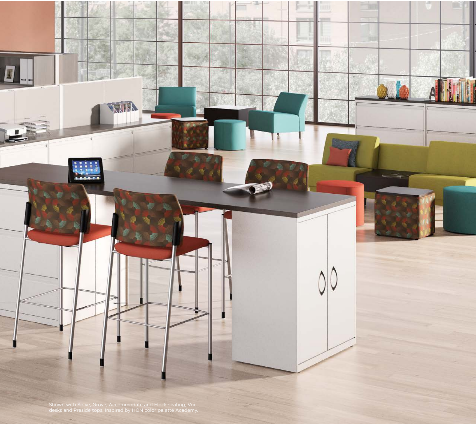
Shown with Solve, Grove, Accommodate and Flock seating, Voi desks and Preside tops. Inspired by HON color palette Academy.

Need a storage solution for a workstation? No problem. Looking for creative ways to archive your files? Flagship does that, too. From active to archival to communal storage, Flagship elements combine to create versatile layouts that maximize space, define boundaries and bring people closer to the things they need to stay productive.