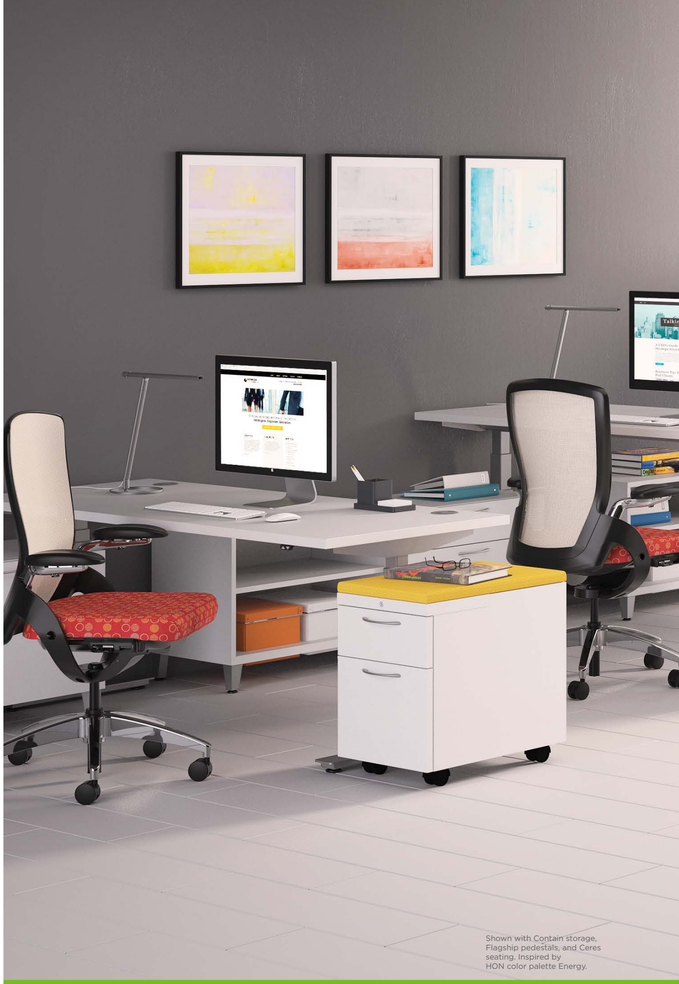
Shown with Contain storage, Flagship pedestals, and Ceres seating. Inspired by HON color palette Energy.