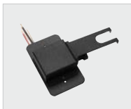
POWER ENTRY PLATE