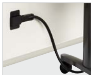
POWER ENTRY CABLE