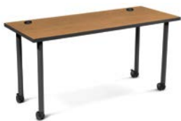
POST LEG Sturdy and affordable (glides or casters)

Time is money, and space is serious overhead. Huddle multi-purpose tables work with you to make the most of both. Tables are available with a choice of top shapes (rectangular or half-round) and bases (post legs, T-legs, or nesting bases). With a variety of options to choose from, you can specify Huddle tables that are easy to set up and easy to rearrange.