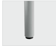
POST LEG GLIDE