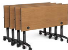
NESTING BASE Space-efficient storage (casters only)