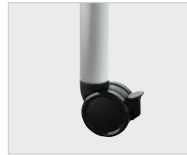
POST LEG CASTER Available on 24" and 30" D tables only.