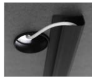
WIRE MANAGEMENT STRIPS