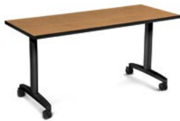
T-LEG Unobstructed leg room (glides or casters)