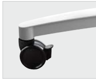
NESTING BASE/ T-LEG CASTER